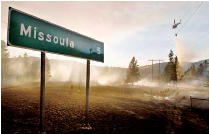
In August 2007, firefighters

So if we have not learned prudence in the normal course of events, how will we respond when the fires grow worse--as they will, even in California, with global warming?