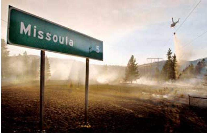
In August 2007, firefighters

ISSUE: Winter 2008 , FEATURE STORIES | December 1, 2007